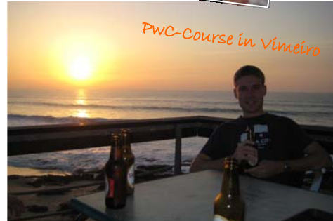
PWC-Course in Vimeiro