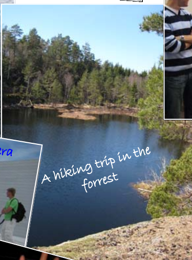
A hiking trip in the forrest