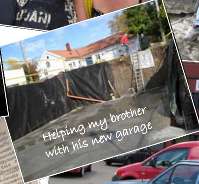
Helping my brother with his new garage