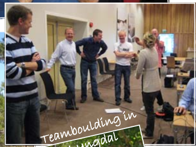
Teambuilding in Lyngdal