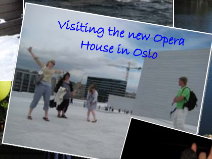
Visiting the new Opera House in Oslo