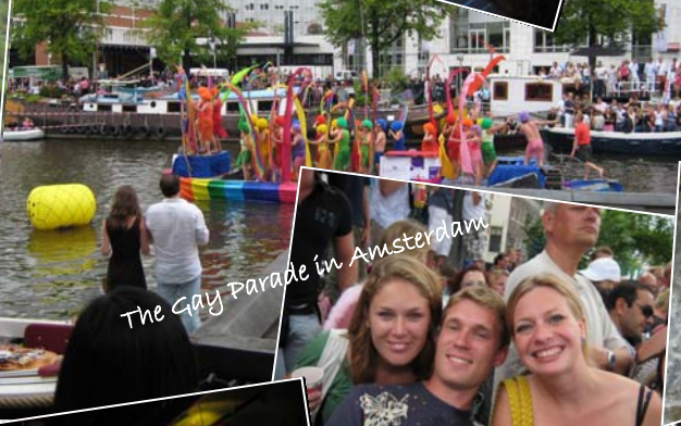
The Gay Parade in Amsterdam