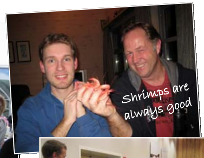
Shrimps are always good