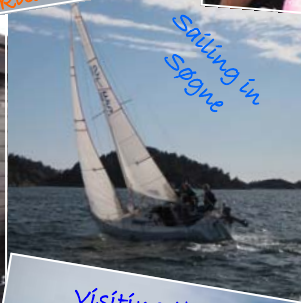
Sailing in Søgne