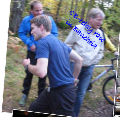
OB-relay race in Bævreheia