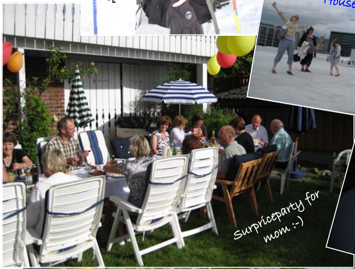
Surprise party for mom :-)