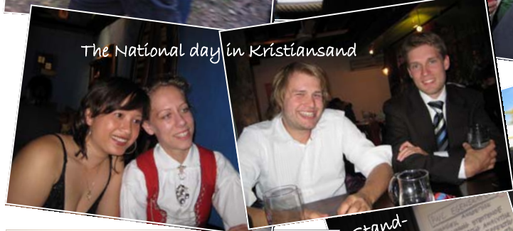
The National day in Kristiansand