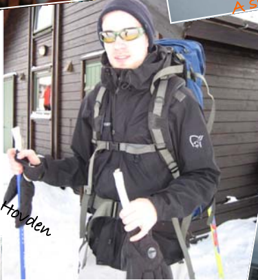
A skitour to Hovden