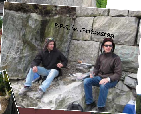
BBQ in Strömstad