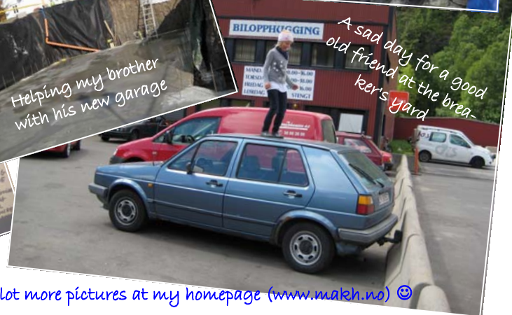
A sad day for a good old friend at the breaker's yard