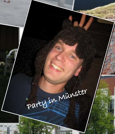
Party in Münster