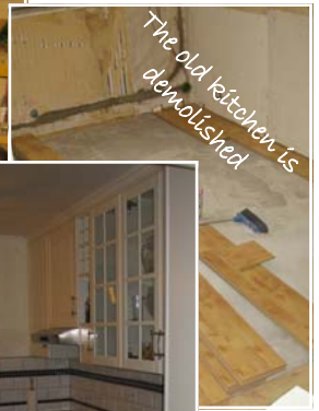
The old kitchen is demolished