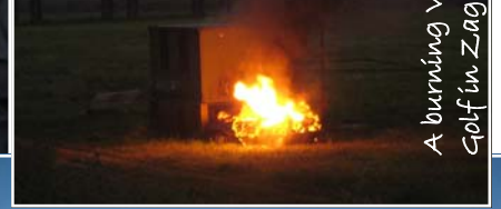
A burning VW Golf in Zagreb