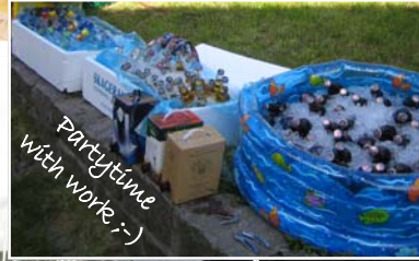
Partytime with work :-)