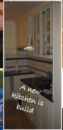
A new kitchen is build