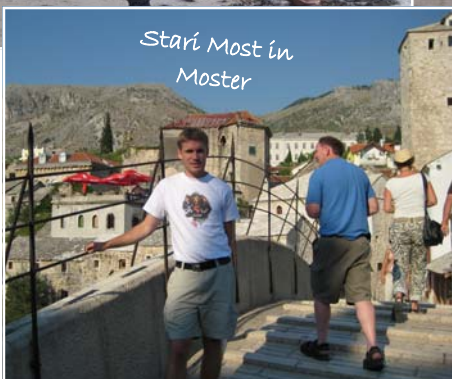
Stari Most in Mostar