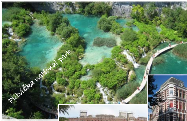
Plitvice national park