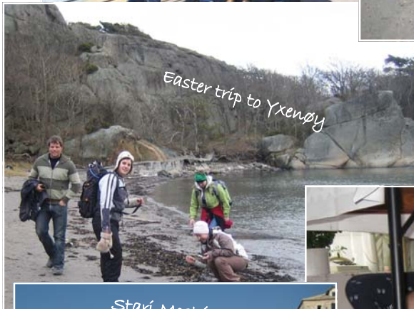
Easter trip to Yxenspy