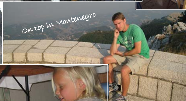
On top in Montenegro