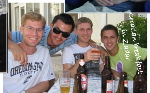
Croatian breakfast in Zadar

There is a lot more pictures to see on my homepage ( www.makn.no ) ☺