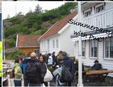
Summerparty with PWC