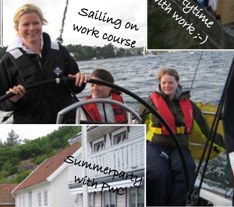
Sailing on work course